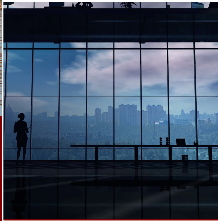
FUTURE OF WORK