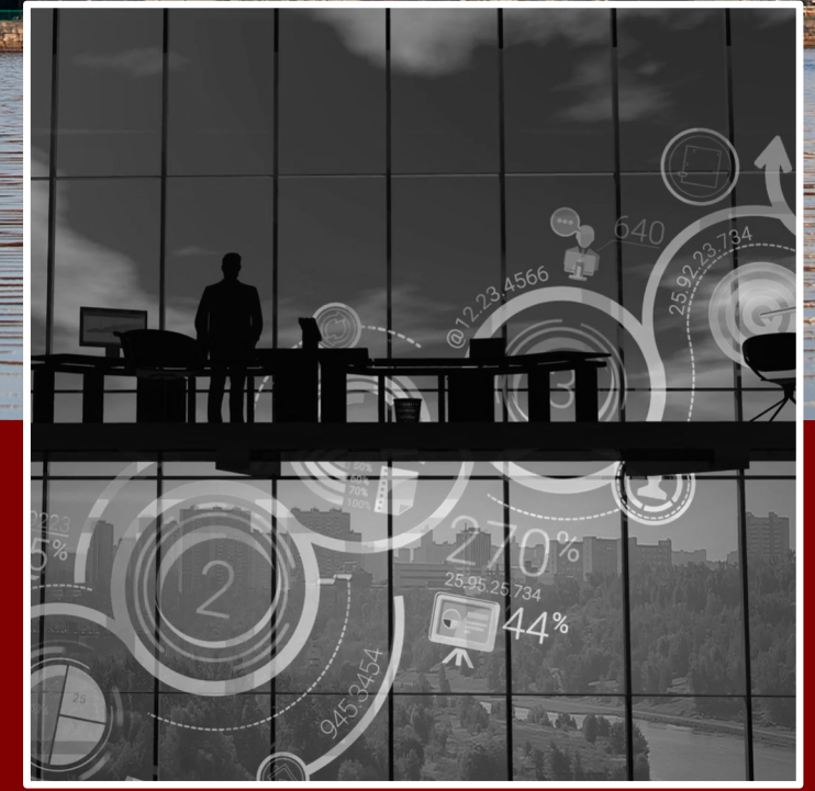
SCHWARZMAN COLLEGE OF COMPUTING