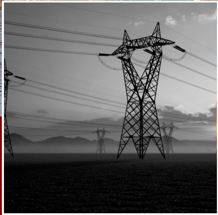
MIT ENERGY INITIATIVE