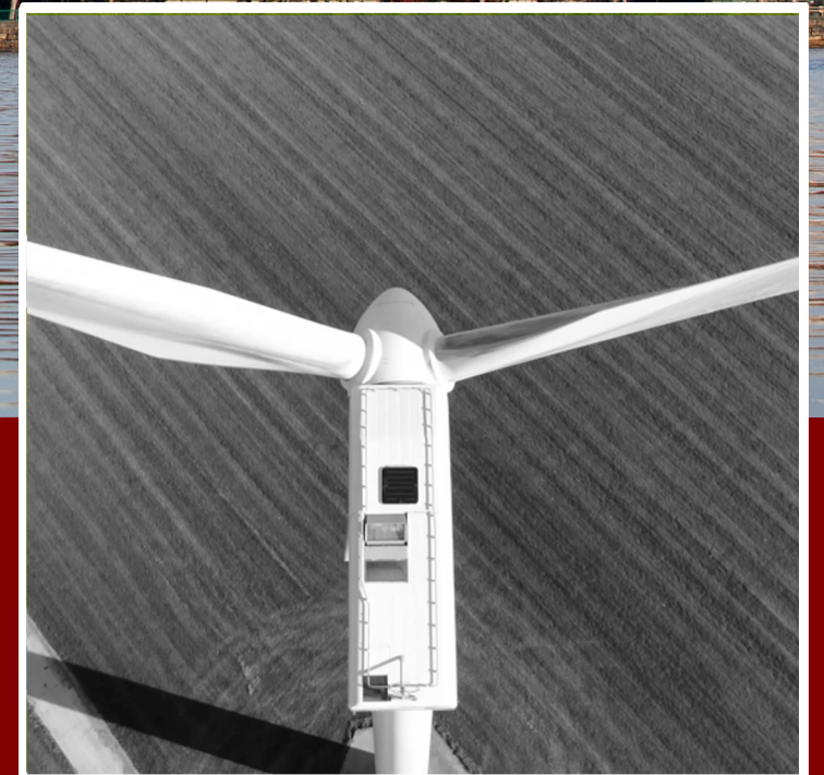
GLOBAL ENVIRONMENT/ SUSTAINABILITY