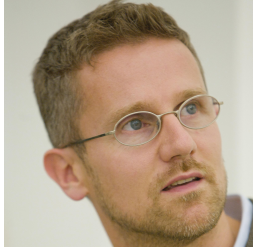
Carlo Ratti Director MIT Senseable City Lab

Cities That Learn About Us Carlo Ratti Director, MIT Senseable City Lab